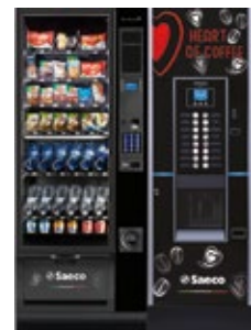
Artico M + Cristallo Evo 600